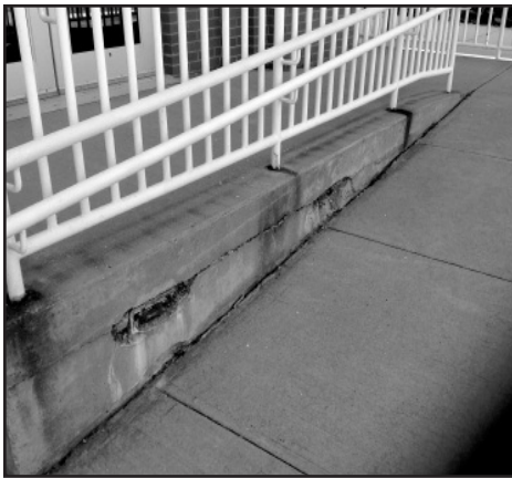
ADA accessible ramp requiring masonry repairs