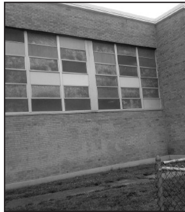
Original windows – over 50 years old

As the District's buildings age (our buildings range in age from 50 – 65 years old), windows, ceilings, roofs, building systems and interior and exterior masonry age out and need replacement. Additionally, the changing state of technology requires that the District evaluate its technology capabilities and upgrade where necessary to maintain program excellence at all grade levels. Undertaking the projects proposed in this Bond Referendum can be accomplished quicker and more cost-effectively with financing through the issuance of bonds than through annual budget appropriations for capital projects.